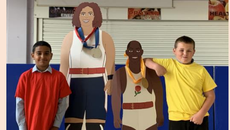
Pupils from Y5 with props from their production 'Precious Emily'

Poetry has been a focus across school and we have chosen poems to read in very year group, celebrating our diverse history and culture. Throughout the year we have had a focus on encouraging children to develop a love of writing through the introduction of writing for pleasure notebooks.