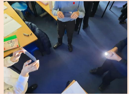
Year 6 Light Investigation