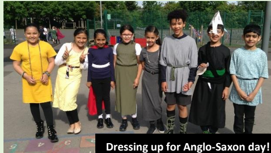
Dressing up for Anglo-Saxon day!

is their sheer enthusiasm and love for learning which has made us all extremely proud. Both the staff and children, have shown amazing resilience, patience and care throughout what has been a difficult and unpredictable year for all. The children's enthusiasm in all that they do make coming to school