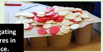
Investigating structures in Science.

exciting and rewarding. Every child should be extremely proud of all they