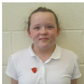
Deputy Head Girl

Congratulations to all our Service Teams who are showing pride in taking on responsibilities