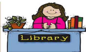
A New Look Library

The English team have been working very hard to move the furniture in the library in order to give it a refreshed look. It now has a more open plan and all the books are clearly visible at all times. Enjoy your new look library!