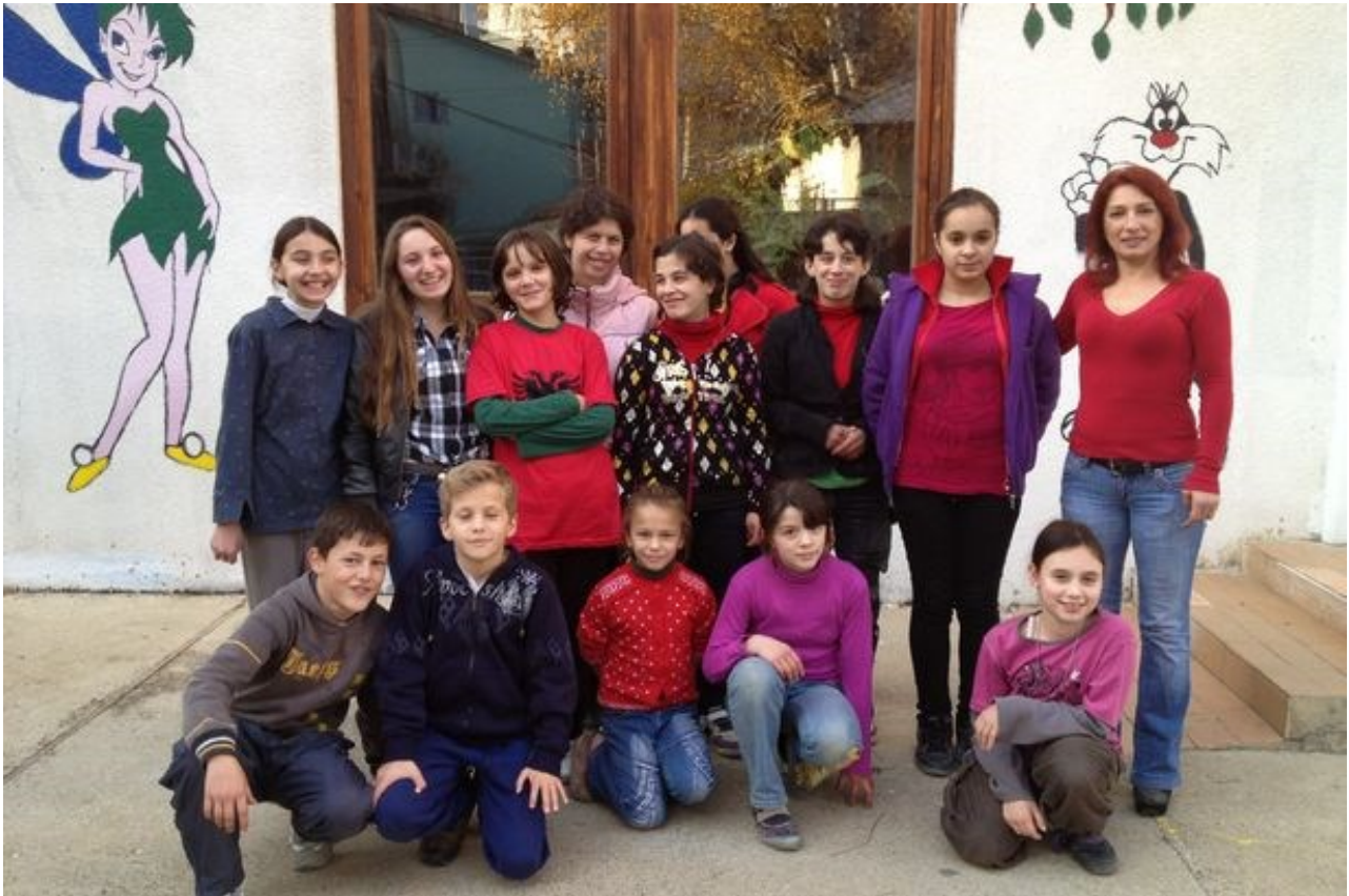
Children and staff from a Kosovo orphanage (2012)